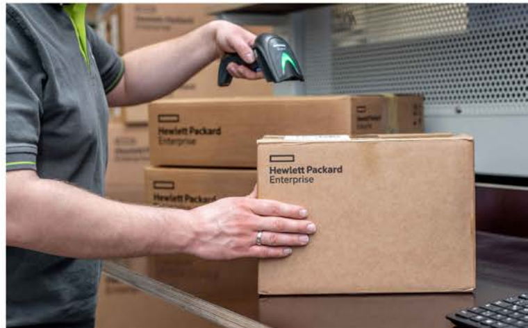
Joint project: “Limes” software goes live on the Asian market

After just under a year of preparation, the successful collaboration was extended to the Asian market in 2020. The “Limes” software was adapted for thirteen Asian countries, including Malaysia, Singapore, Taiwan, Thailand and Korea.