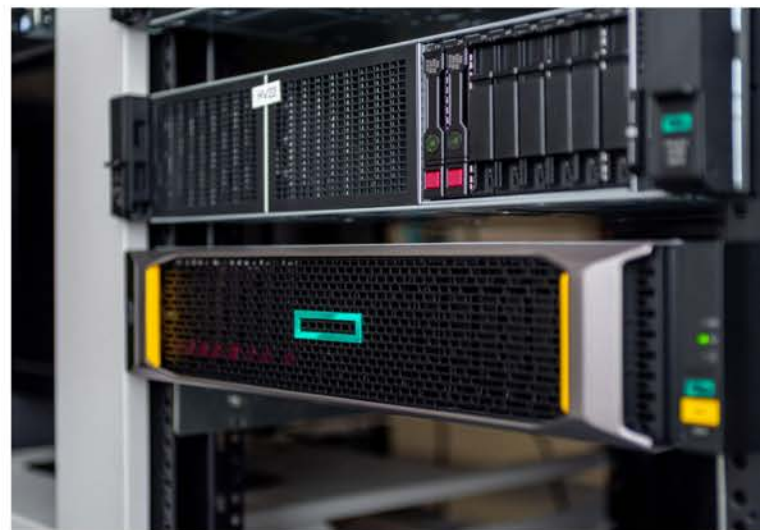
HPE relies on the expertise and reliability of CDS for demo equipment management across EMEA